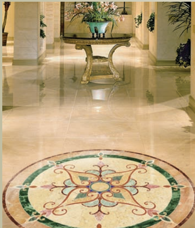
The versatility and the ability of water jet cutting to interpret all generations of designs is illustrated (clockwise from far left) by a 13-foot long monarch butterfly in flamed granite and brass installed outside the Audubon Insectarium in New Orleans, a fine art interpretation of a compass rose, a contemporary bowling alley in luxury vinyl and a contemporary residential design.

Young designers like Aalto are on the cusp of the new contemporary design. As she puts it, “Fully appointed luxury, but contemporary is a new idea interior designers are starting to get excited about!” 🙌